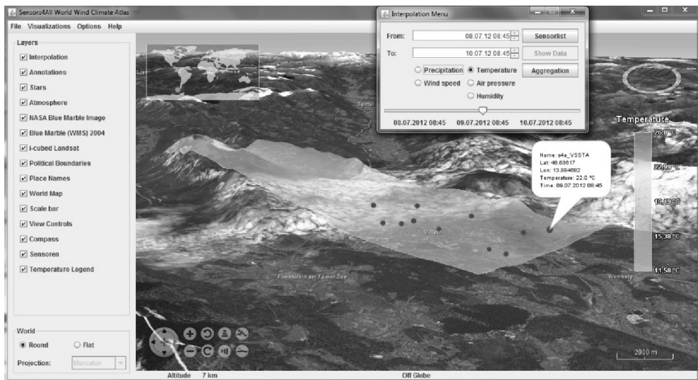
Fig. 2: Overall result of the Visualization tool with the options in the interpolation menu, a sensor annotation and the sensor visualization with the temperature phenomenon

In figure 2 the overall result of the visualization tool can be seen. In the upper left corner a menu is situated where all features can be found. Below a layer list is shown, where each layer can be checked or unchecked to control its visibility on the map. In the lower left corner a control for switching the 3D globe into a flat projected 2D surface can be seen. The virtual globes map is implemented with a compass in the upper right and an overview map in the upper left corner. Different other control features are situated at the bottom of the map window to ensure a simplified navigation.