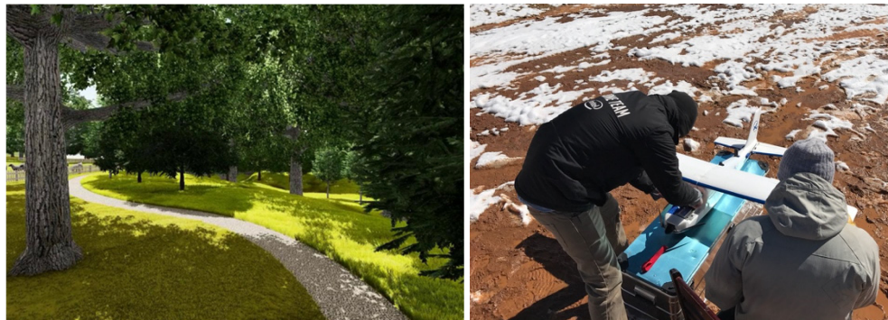
Fig. 2: Benefits of UAS data includes enabling students to design with more accurate contour data (left). It has also resulted in partnerships with industry, including collaborating with Intel's drone team (right).

This improved data has also opened the door to collaboration with other disciplines and directly led to several research projects and industry partnerships. The Department partnered with Intel to research the use of UAS and virtual reality for understanding and designing in the landscape. In another instance, after collecting contour data, a property owner connected a faculty member with an engineer and surveyor who were conducting simultaneous work on the project to enquire about sharing data. This led to conversations and additional data that contributed towards the students' work on the project. Several similar incidences have occurred with city staff who were interested in having access to the drone data.