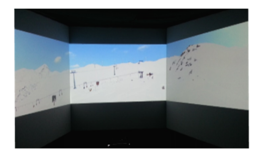
Fig. 3: Panoramic projection of the alpine tourism

short oral statements (1-2 minutes) on their perceptions. Finally, they answered socio-demographic questions.