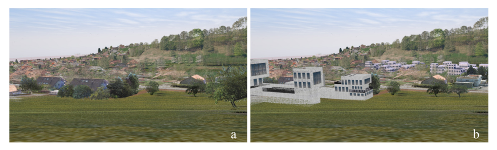
Fig. 3: Still images from the walk-through in the virtual landscape showing the current situation at the study site (a) and the state of the «Vision 2050» (b)

A pedestrian can now observe landscape changes from the current situation (3a) and the «Vision 2050» development state (3b) because of our presented workflow (Fig 3.).