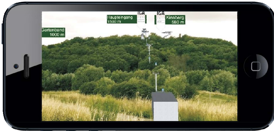
Fig. 2: Showing future buildings of the IGA 2017 in Berlin using AR-apps

The accuracy of the GPS-signal and the mobile internet connection still caused some problems from time to time. Streaming large files to the user's smartphone may take a while so the students also thought about using applications that allows saving the file on the local storage of the device. The application "Sightspace 3D" is a mobile 3D viewer which also offers the opportunities of an augmented reality mode. The file can be referenced either by a geo-position or by using a defined marker. If neither of these tracking-systems is used the user can also define a position by fingertip on the screen. The realizable level-of-detail depends on the hardware configuration of the device, so there are no limits by the mobile internet connection.