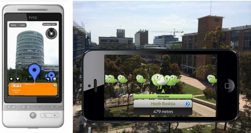
Fig. 1: Campus navigation at University of Kaiserslautern (left), UNSW Green Trail (right)

However, there is a problem with the accuracy of the GPS-signal, although the information in both scenarios is geo-referenced with a variation of five meters the content may start to “jump around”. If the distances between the overlay contents are not that far, it might also get difficult for the user to assign the virtual information to the real objects correctly because the different overlay information starts to interfere with each other.