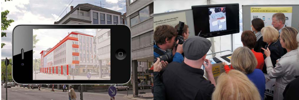
Fig. 3: Augmented structure elements of 1950s architecture in Saarbrücken

project took place, the user could do a virtual walk-through, get an impression of the past and inform themselves how the city of Saarbrücken plans to bring the feeling back into the modern day's street life (BROSCHART et al. 2013).